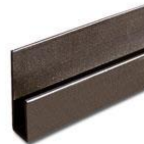
Oil Rub Bronze